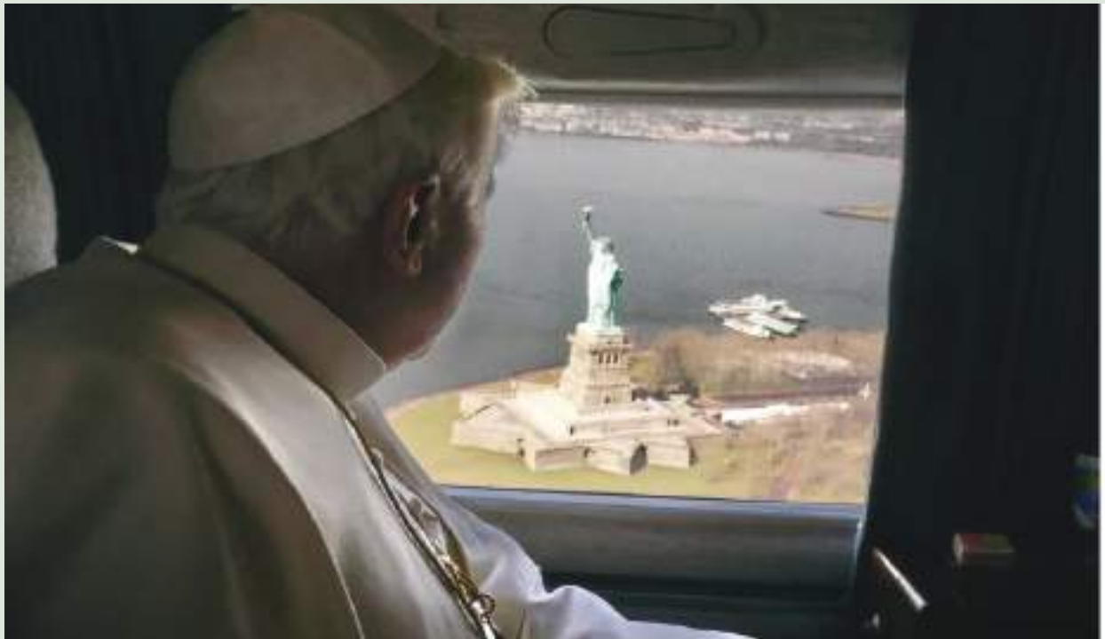
Aboard Shepherd One, Pope Benedict enjoyed the statue of Liberty on his visit

Popes never retire but die in their ministry, but Pope Benedict changed that tradition when he resigned. He lived quietly in a simple residence within the Vatican grounds until his death.