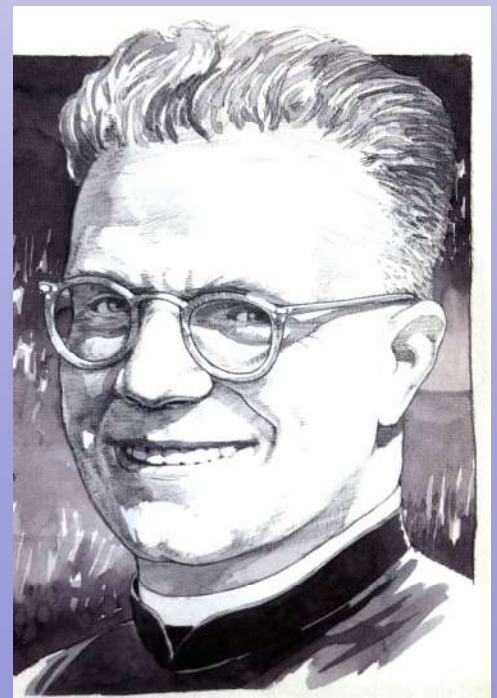
Father Alfred Delp